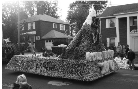
Beta Rho won first place in Highly Competitive Big Float at Homecoming 2010, among other awards received.